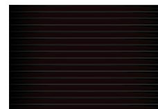
INDUO iTP poles